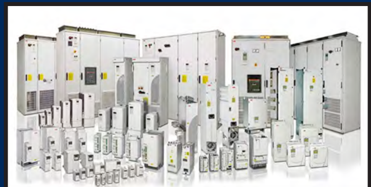
MV & LV VFD